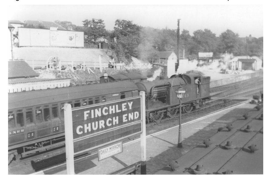
A Gresley N2 pulling a Quad-Art set out of Finchley Church End (since renamed Finchley Central) in the 1930s.

the tube trains in 1907 helped relieve this congestion. But in 1910 there were still only 63 trains a day between Finsbury Park and High Barnet. The LNER did some trial running with a Church End to Edgware shuttle in 1929 but this was withdrawn less than a year later in 1930.