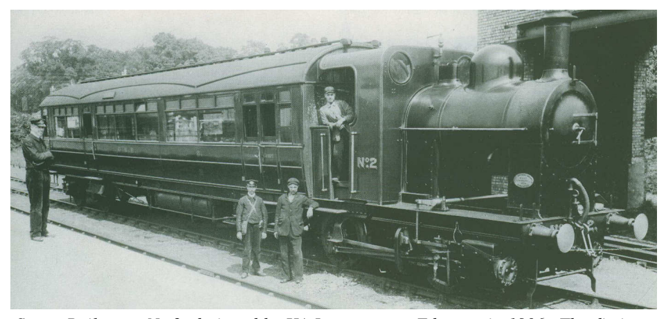
Steam Railmotor No.2, designed by HA Ivatt, seen at Edgware in 1906. The diminutive 0-4-0T mounted on the same frame as the 53-seat car was not powerful enough to draw an extra coach when extra capacity was needed, and was therefore abandoned after about a year.

The pictures were a joy to see, for example those of the stations with ladies clad in the long dresses of the day, and horse-drawn vehicles. At Highgate a cast iron gent's urinal stood on the island platform. Many pictures of the stations were taken by the railway company and their staff posed in them. Many buildings still stand and are protected. Locomotives of the day were a C2 4-4-2T, a Stirling 0-4-4T and a Stirling F2 0-4-2, to name a few.