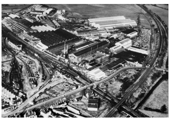
An aerial view of the Falcon works from around 1963

they are expected to have a fair longevity, at least 25 years, since their installation is a fairly major event. To this end they are stringently tested, the main tests being heat run (short circuit at reduced voltage), Over Voltage (like a boiler test) and Impulse test (to simulate lightning strikes). The last of these could be quite exciting as it used impulse generators that could produce up to 3,600,000 volts. To obtain a large surge they used to charge up capacitors and then discharge them using spark gaps to simulate lightning under various conditions. When "fired" they made quite a bang, occasionally causing alarm on Loughborough station which backed onto part of the test area. The business is still in existence: it was bought by BTR in 1991 and sold to FKI Group in 1996. It is now known as FKI Energy Technology and still makes Rotating Machines. Transformers. Switchgear, Locomotives and power gear. A most interesting evening, my only regret being that I was unable to take notes in the darkness of the slide show and thus missed most of Malcolm's asides and anecdotes.