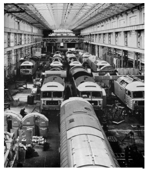
Class 4 production during the heyday in the late 1960s

opment, some of which were more successful than others, one of their best known being the Type 4 which became the BR Class 47.