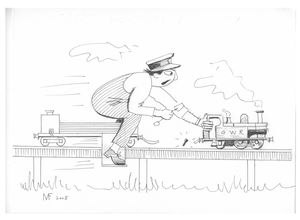
Great Western Runaway.

In conclusion I am now delighted with the engine. However, if I had realised when I started building this kit loco in 1998 what would be involved, I would never have started. Before Winsons started producing kit engines, I was thinking of buying a second-hand loco. In retrospect that may have been a better option, but I appreciate nothing is straightforward as far as steam engines are concerned.