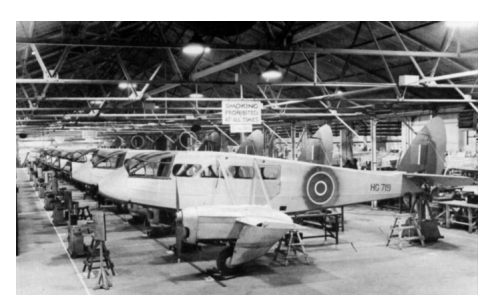
Production of Dominie aircraft in 1944

rotary engine and Short 184 seaplanes. Their involvement with the aircraft industry resumed during WW2 with HP Hampden fuselage repairs and the construction of deHavilland DH89 'Dominie', some 455 of which were