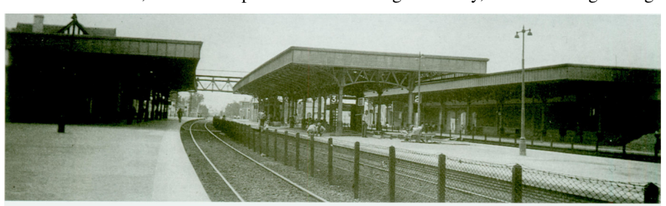
8. Buenos Aires Great Southern Railway: Louras de Zamora suburban station 9.5 miles from Buenos Aires, Plaza Constitución terminus, looking south about 1926. Note the wire fence between the tracks to stop passengers alighting on the wrong side.

The platforms were very low and to deter passengers from rushing across the tracks to get between platforms a fence was erected between the double track lines; this also prevented passengers getting off on the wrong side, and possibly in the path of another train. However many would step out of the carriage onto the top of the fence and jump down anyway. The platforms were staggered such that a stopped train would not block the level crossing roadway, the crossing being