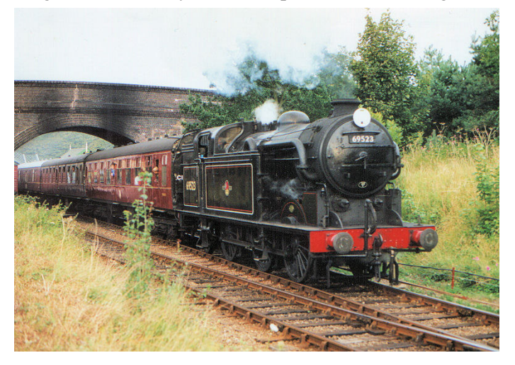
The preserved Gresley N2 seen pulling out from under the bridge at Weybourne on the North Norfolk Railway.