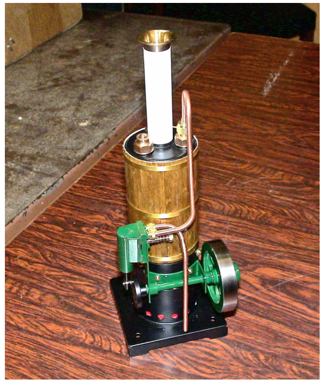
The 'Polly Project' vertical boiler and engine, which ran sweetly on air from Mike's bicycle pump.

and the clear winner received an engraved crystal tankard commemorating the occasion.