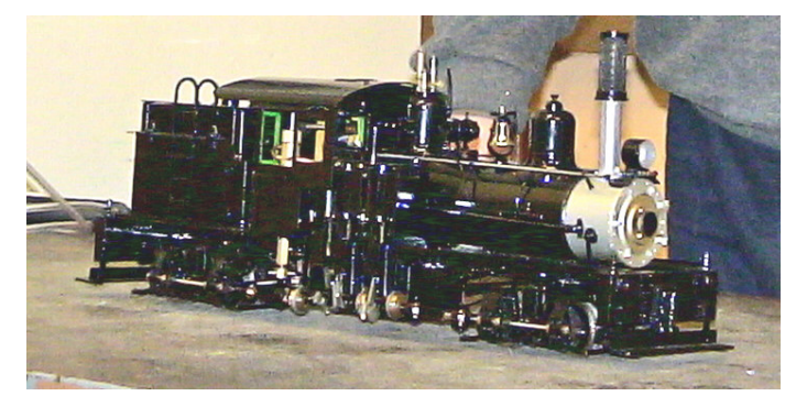
A close-up of John West's 3-cylinder 2-truck Shay loco

The bought off-the-shelf gauge one model runs ex-