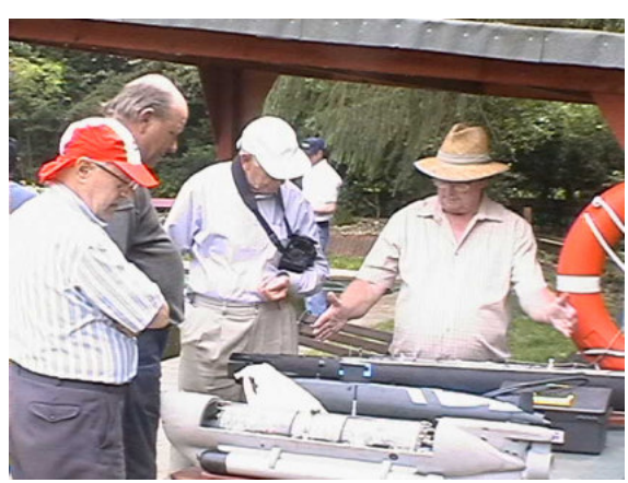
Discussions and advice beside the pool

Autumn 2006 marks the tenth anniversary of start of work on the boat pool at Tyttenhanger. When clearing my house for the move down to Eastbourne this summer I came across a few old photographs showing the early work on the project. Those of