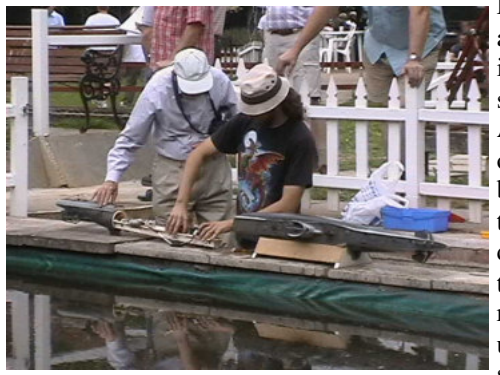
The Robbe U-47

installed to ensure a constant circulation of the water.